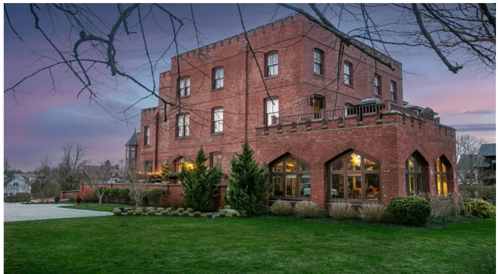
Eastbourne Lodge c.1892