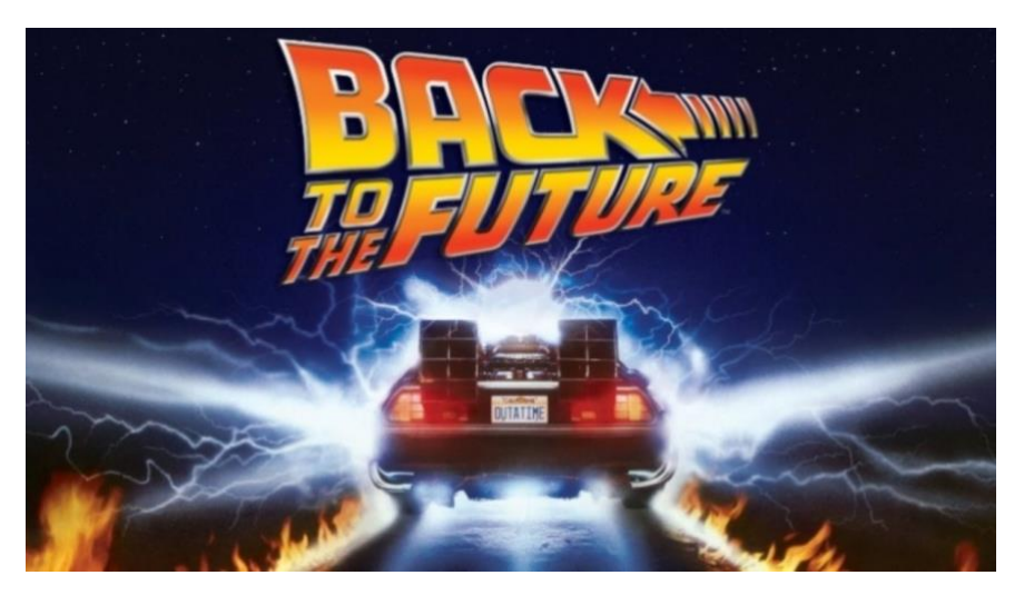
In 1985, Back to the Future was the highest-grossing film.