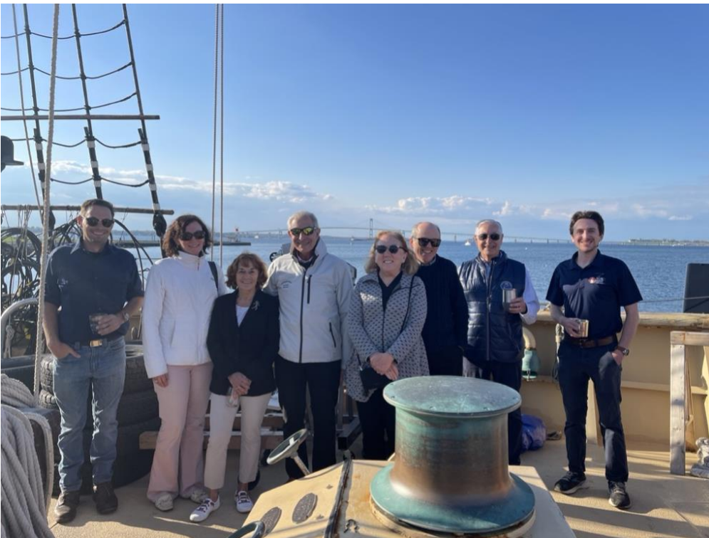
April 25, 2023: Cocktails with the Captain on board Oliver Hazard Perry