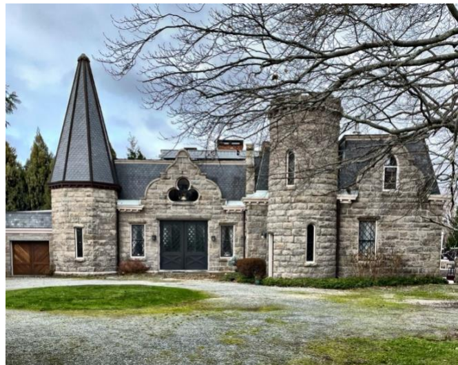
Belair Carriage House