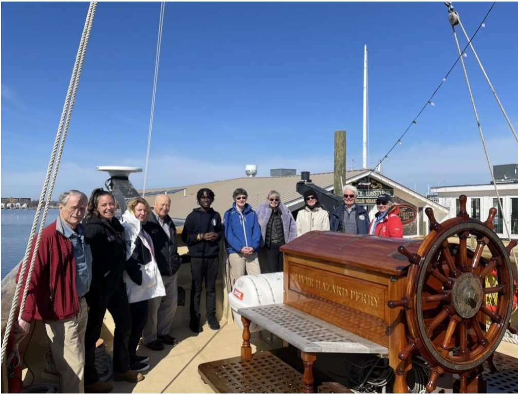
March 21, 2023: Coffee with the Captain, Oliver Hazard Perry