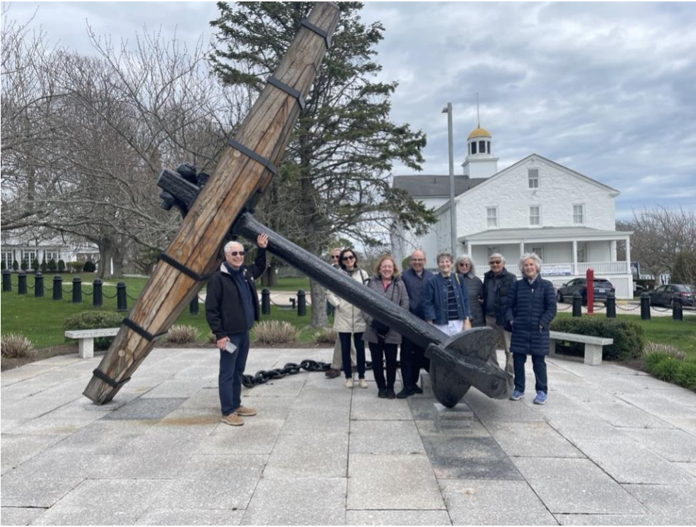
April 19, 2023: Naval War College Museum Tour