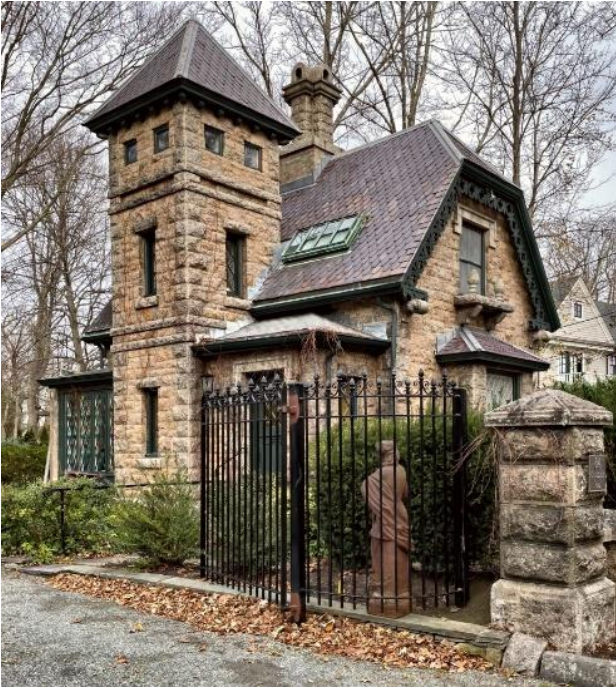
Belair Gate Lodge